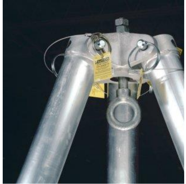
Wallace Tripod Crane crane sizes model numbers