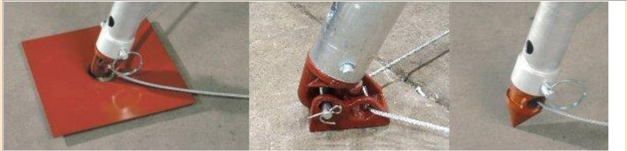
(L to R) Options: Mud Base Plate, Rubber Base, Spike Point. Note lashing for all configurations.