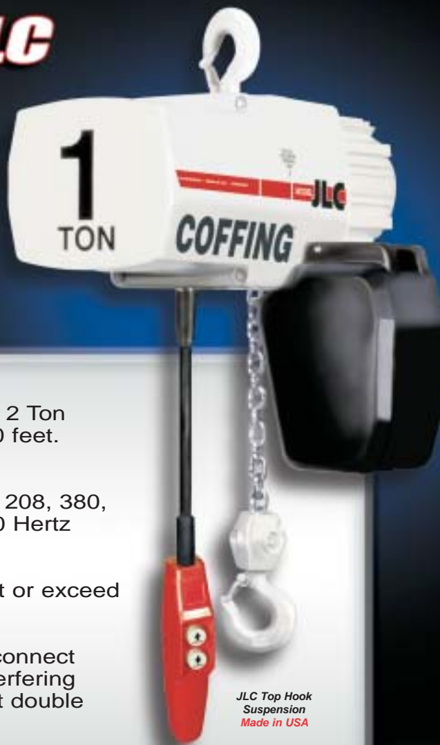
JLC Top Hook Suspension Made in USA