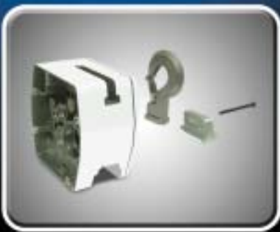
Easy Change Top Suspension