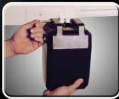
Quick Connect Chain Container