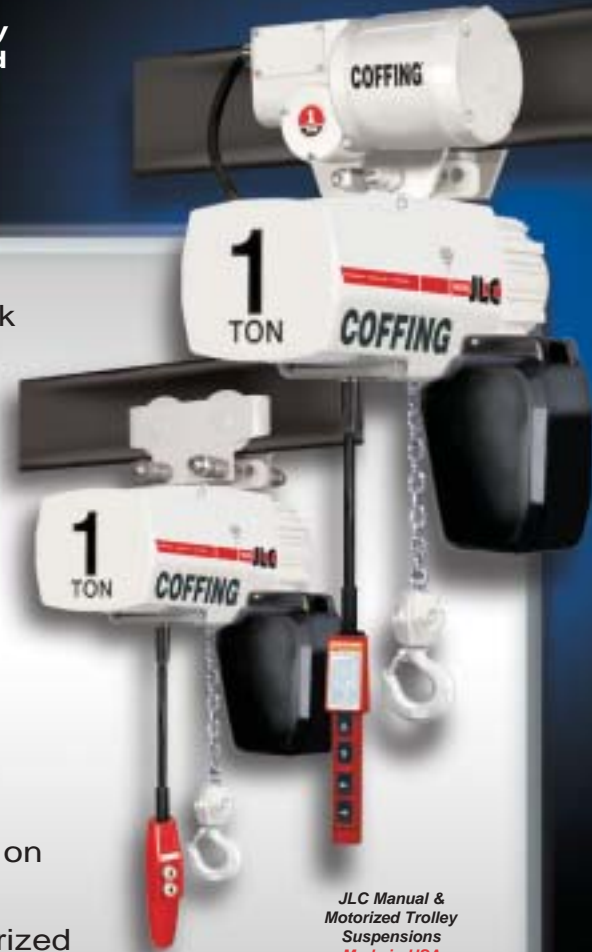
JLC Manual & Motorized Trolley Suspensions Made in USA