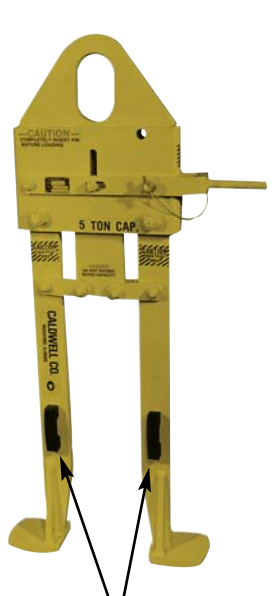
Spacer Blocks Installed for 16-18" coil I.D.'s. See Instruction Manual for details.