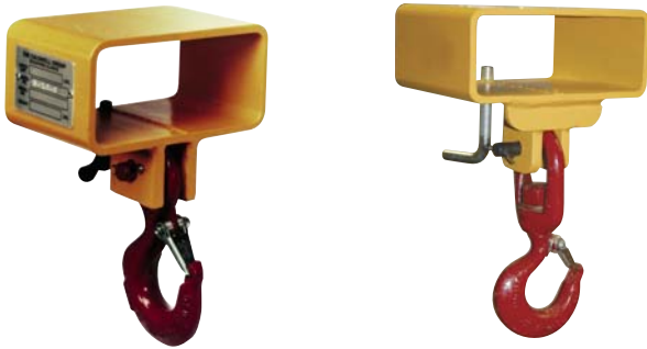
(Fixed hook shown)