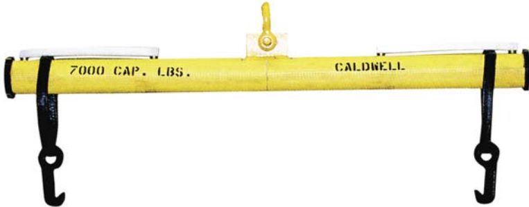
Unit shown with Option J.