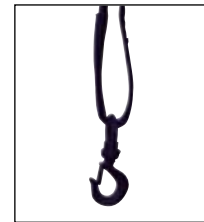
STANDARD Swivel Hooks