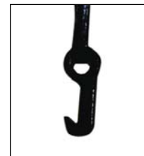
OPTION J J-Hooks Order Model 36LJ-3.5