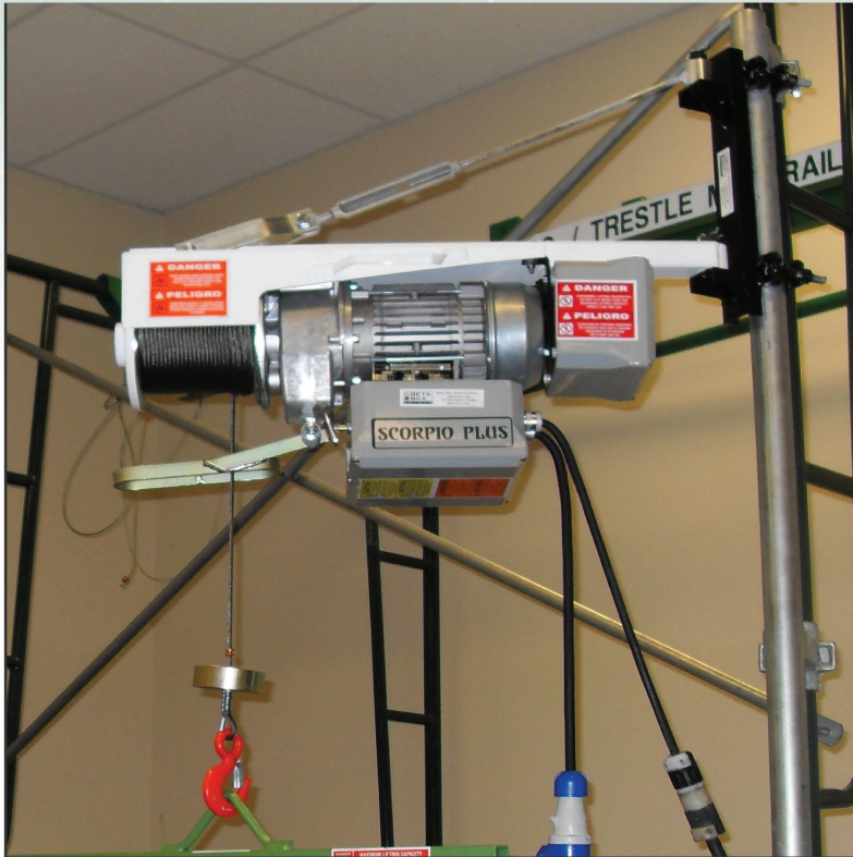
POST MOUNT: 60-53